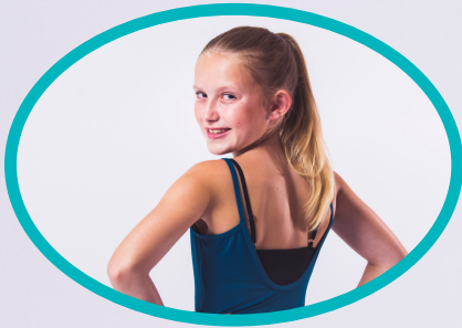
Hair Pulled Back